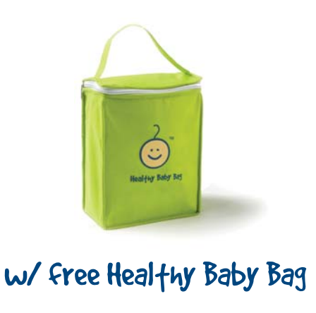
Price = $14.99 Style #CW171

We have taken everything you need in a diaper bag and put it all into this bag. From separate compartments to the best materials, this is the bag for the most discriminating of patients.