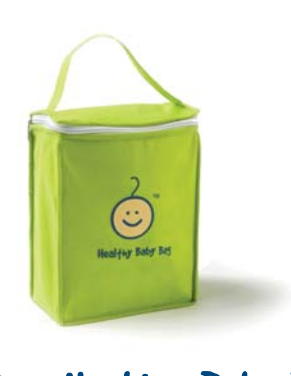
w/ Free Healthy Baby Bag